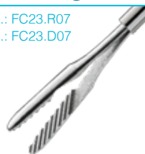
23G Forceps Shah X-tra Grip