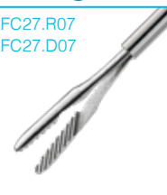
27G Forceps Shah X-tra Grip